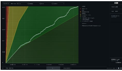
Screenshot Octopus Monitas software