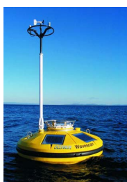
Directional wave rider buoy