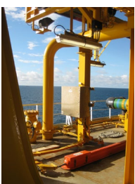
Long Base Strain Gauge on deck